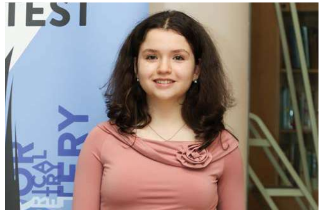
2 nd place