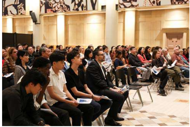
The crowd listening attentively.