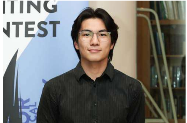
1 st place (tie)