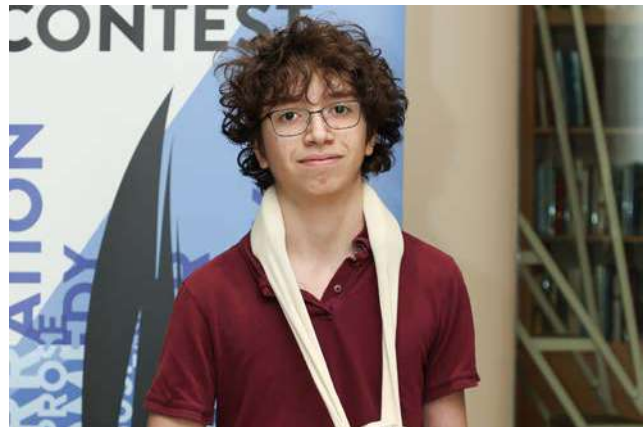
2 nd place (tie)