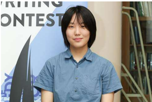
2 nd place (tie)