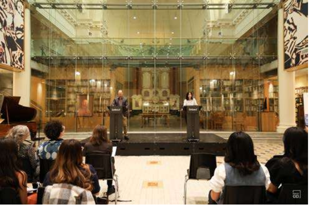
The gala begins.