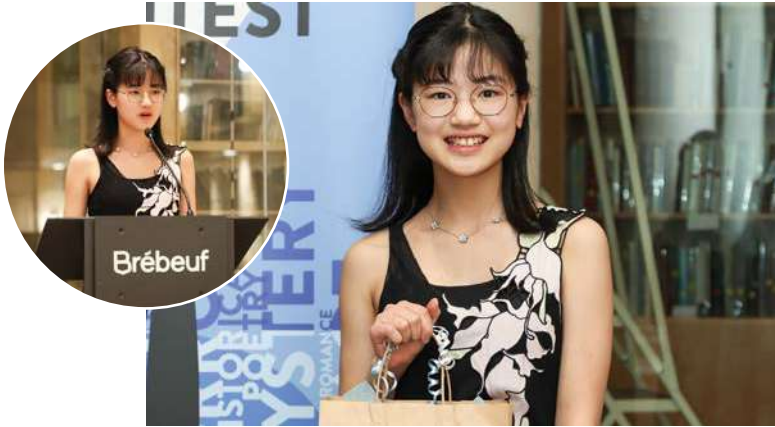
1 st place