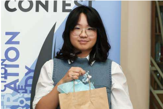
1 st place (tie)