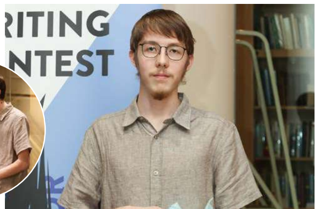
3 rd place