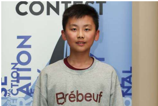
2 nd place (tie)