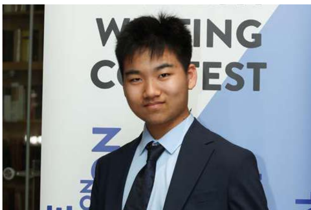
3 rd place