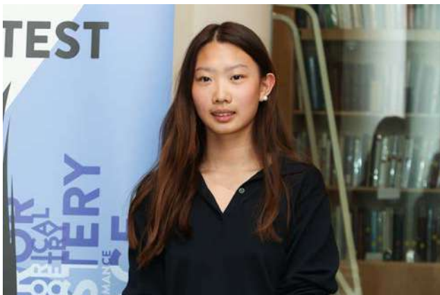
3 rd place (tie)