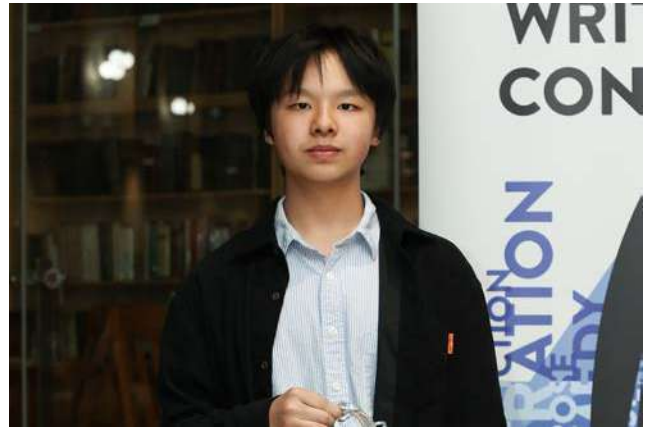
3 rd place (tie)