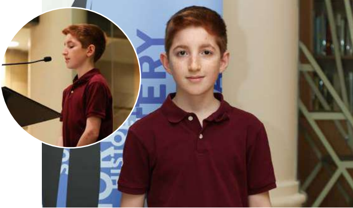
1 st place (tie)