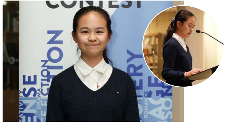
1 st place (tie)