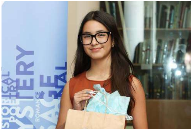
3 rd place (tie)