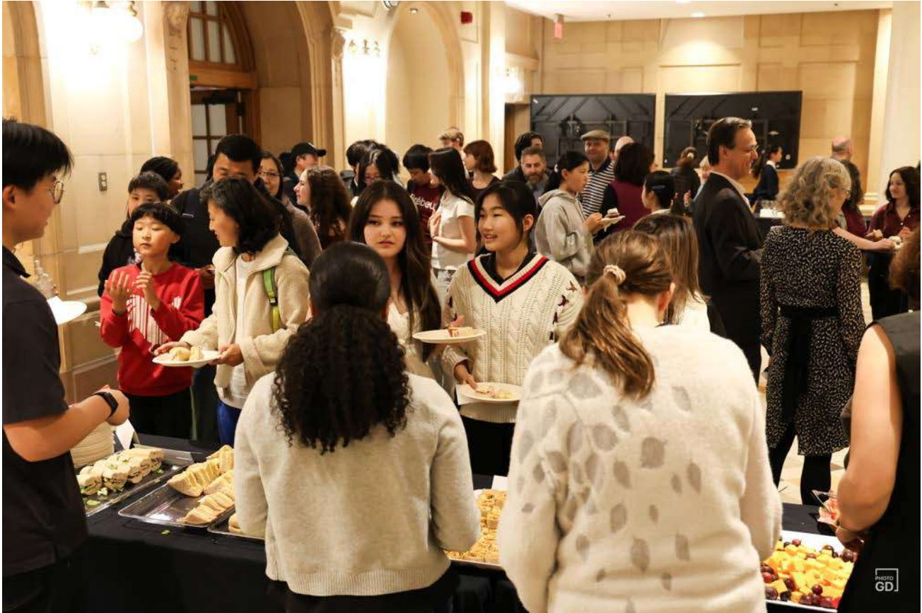
The evening begins with refreshments and music.