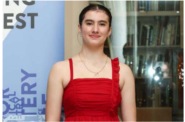
2 nd place