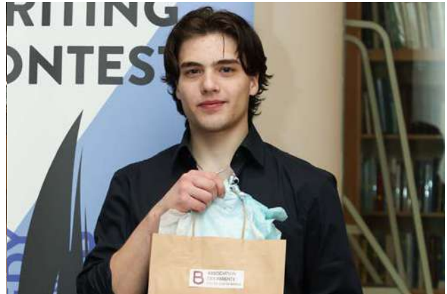
1 st place