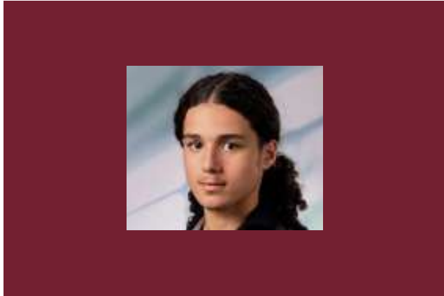
1 st place