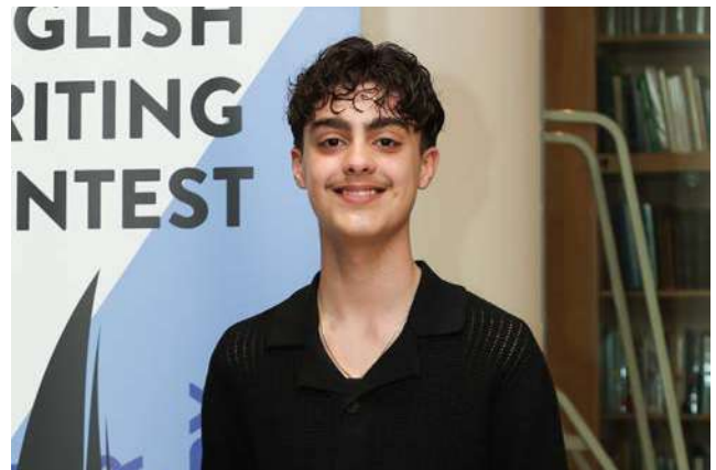
3 rd place (tie)