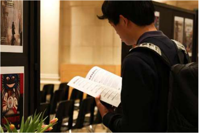
A guest perusing previous Footprints.